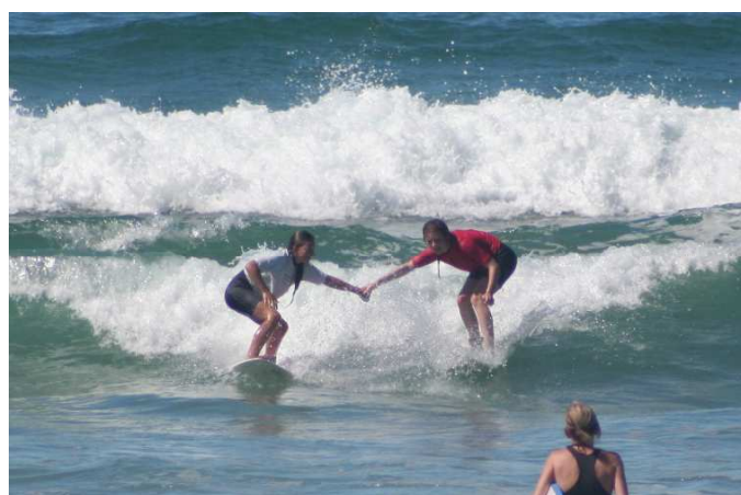
Future Tandem Surfers?! Great mates in the intermediate Shortboard April Comp