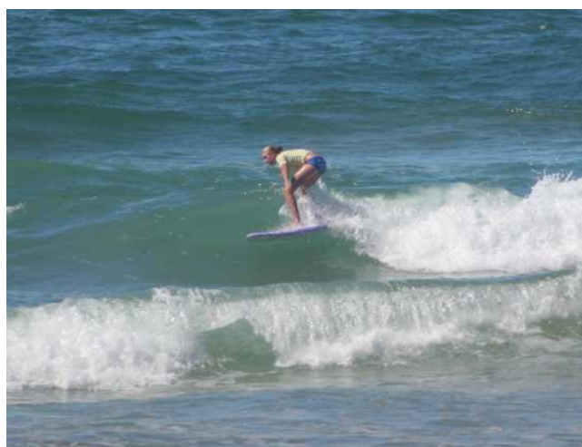
More action from the Intermediate Shortboard heats at the April Comp

CODE OF RESPONSIBILITY Members please be aware that there are inherent risks in surfing activities that common sense and personal awareness can reduce. Observe the Girls Surfriders Code of Responsibility for a great surfing session. Entering and leaving the water be careful of shore dumpers, possible rips, rocks and other surfers. Watch for items that may be floating in the water. Know your ability: Be in control of your board and your body. If you feel that the conditions are beyond your comfort zone, don't be compelled to enter the water, ask yourself: "Am I going to enjoy this surf?" Be Alert: Watch out for other surfers, loose boards, shallow water, slippery rocks, anyone in difficulty and don't knowingly drop in. Check that your board and leg rope are in good order and protect yourself from the sun and the cold.