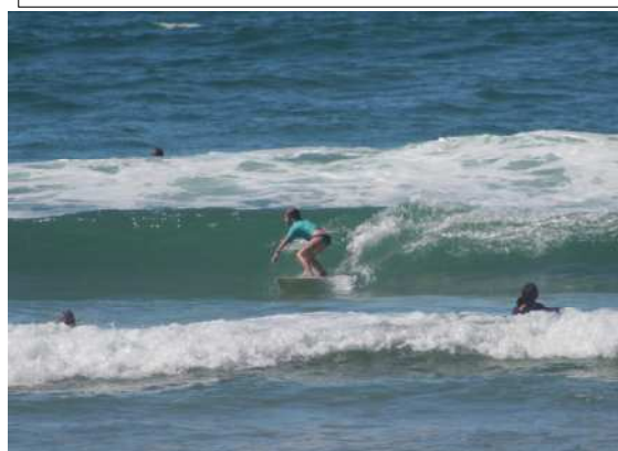
Action from the Intermediate Shortboard heats at the April Comp

What: Winter Championships When: Sunday 12th June 2011 Where: Rainbow Beach, Bonny Hills Time: 7am sign in, 7:30am - 1st heat in the water