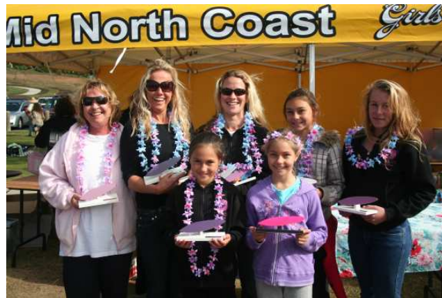
Our Winter Champions for 2010